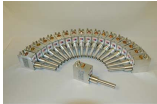
Figure 1: ASI's ULN detectors.

Here is a new ultra low noise x-ray detector capable of discriminating very low energy photons. The new device utilizes a NaI(Tl) scintillator, low background construction techniques and low noise components. The ultra low noise (ULN) detector has been successfully used by the University of Washington and Argonne National Laboratory Collaboration in their lower energy resolution inelastic x-ray scattering (LERIX) spectrometer. The ASI ULN detectors used in the LERIX experiments are shown here in Figure 1. The detectors as installed in the LERIX experimental apparatus are shown in Figure 3.