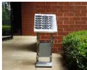
Solar Powered Outdoor DRM

The DRM provides live radiological data for display, archiving and trending in real-time mapping software programs (e.g. TeleMap)